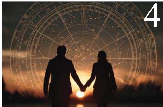
Demi Moore