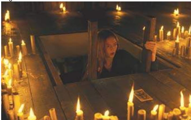
Someone's been leaving the attic light on again!