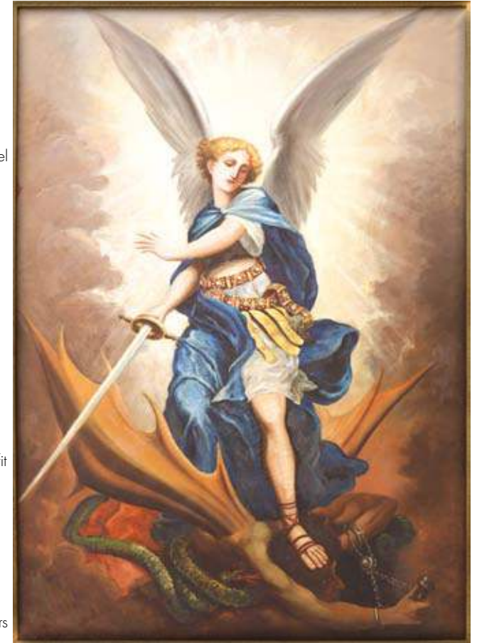
Archangel Michael from St. Peters Church in Old Jaffa, Tel Aviv, Israel from circa end of 19 century.