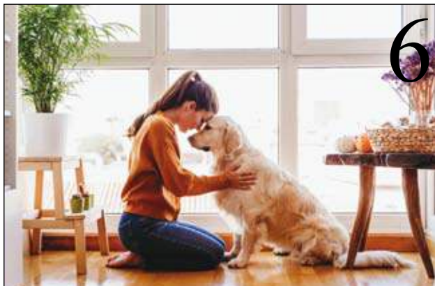
Marisa Abela