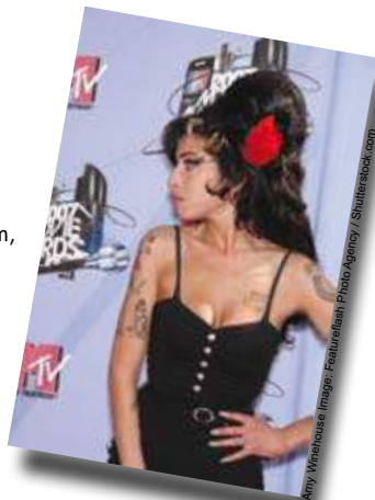
Amy Winehouse in 2007