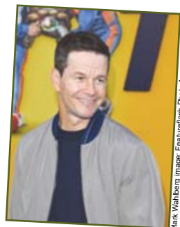
Mark Wahlberg image: Featureflash Photo Agency / Shutterstock.com

It is thought the USA release is going to be the 15th March, moved up from the 22nd. The UK release date is likely to be the same - keep an eye on cinema listings.